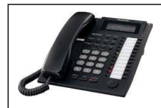
Units available in Black and White