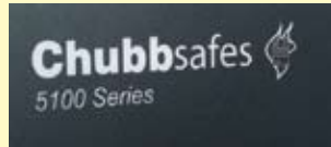
5100 Series - 1 hour fire rated

Secured by one 3-wheel Keyless Combination Lock listed under UL Group 2, CEN Env 1300 Class B, A2P Class CNPP B/E_14, Vds M102362/ Class 2/08. Capable of 1,000,000 changes of code. The operation of this lock is simple. The code can be changed easily.