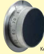
Keyless Combination Lock