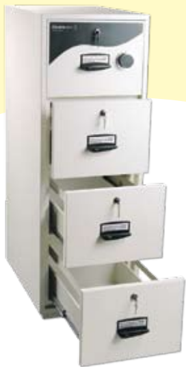
4 Drawers RPF Cabinet comes with Individual Locking

The RPF Cabinet is placed inside a furnace and heated to 927°C for 1 hour (5100 series) and 1010°C for 2 hours (5200 series) and is left to 'soak-out' to simulate an 'after fire' environment. The Cabinet has been designed to limit the internal temperature to not more than 177°C.