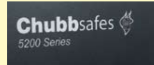
5200 Series - 2 hour fire rated