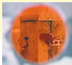
A Chubb Safes cabinet in the furnace showing its resistance to temperatures over 1000C for upto 2 hours.