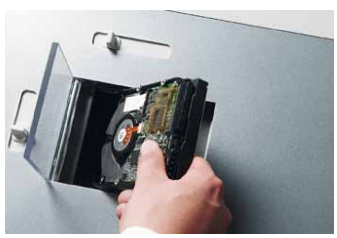
FEEDING CHUTE WITH SAFETY FLAP The electronically controlled, transparent safety flap is an important part of the SPS (Safety Protection System) package. The punching die can only be activated if the safety flap is closed.