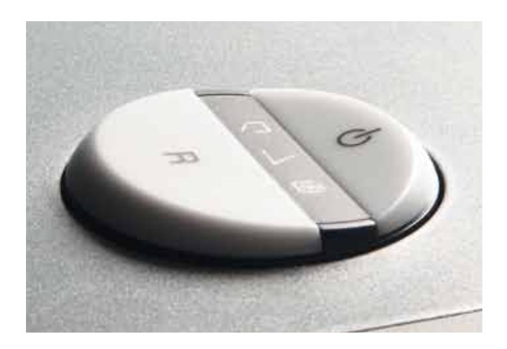
EASY_SWITCH FOR INTUITIVE OPERATION The intelligent multifunction control element indicates the operational status of the machine with colour codes and back-lit symbols for safe and easy operation.