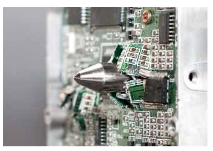
PUNCHING DIE FROM HIGH GRADE TOOL-STEEL The high quality punching die is made of hardened, nickelplated tool steel. Durability is also guaranteed by a powerful single phase motor rated for continuous operation in combination with the sturdy "twin drive system".