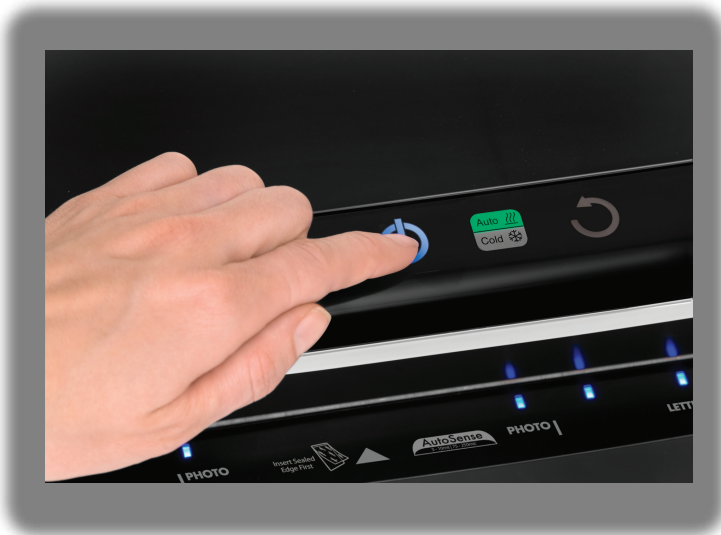
Touch Panel - Power button