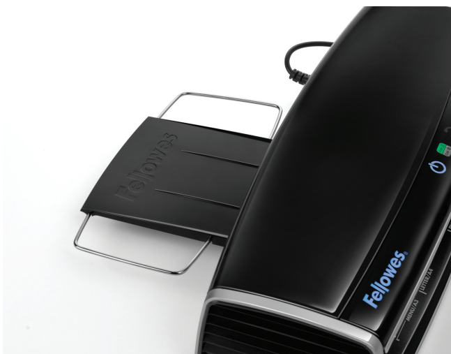
Back tray to support the laminate result