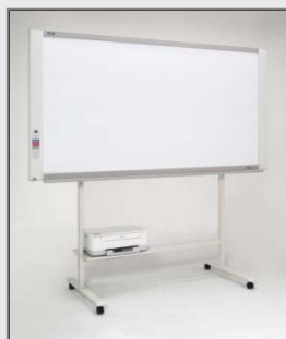
M-18W Wide model