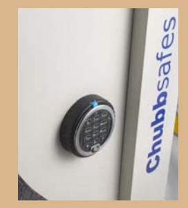
c) Z03 Digital Combination Lock, listed under UL Type 1. (Power Source 1 unit of 9V size battery) Furniture Projection: 38mm

Drawer - ABS Drawer c/w velvet and Brackets