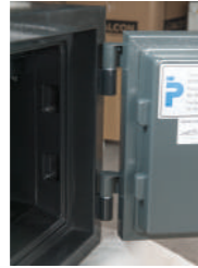
Tongue & Groove