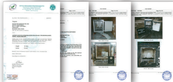
JIS S 1037 : 1989 FIRE RESISTIVE CONTAINERS

A time delay lock-out is activated if the false number is entered more than 3 times.