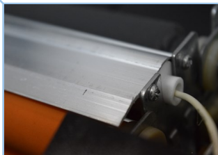
Heating Plate Hot Tube Technology