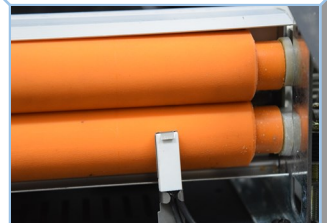
4 Quality Roller Feeder