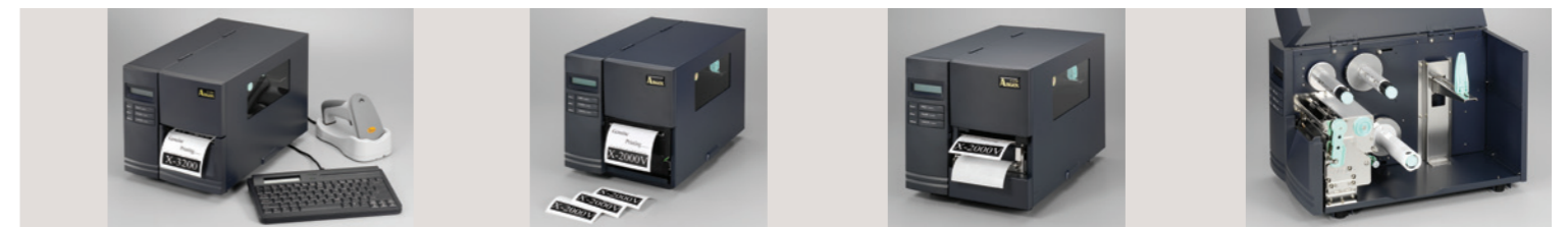
> X Series, Argokee & Scanner

The X-3200 industrial barcode printer features 300dpi printing for high quality text and graphics on fabric labels, safety labels and labels for small items such as jewelry. The heavy duty X-3200 is capable of 5ips print speed using its 32-bit RISC microprocessor. The 8MB Flash and 16MB DRAM onboard memory facilitates high quality printing. An internal RTC lets you print time and dates on labels. RS-232, parallel, USB interfaces allow easy plug-and-play integration with your current system. For stand-alone operation the X-3200 has a standard PS/2 interface for connecting an input device such as a keyboard or scanner, as well as a multilingual LCD display for convenient installation, configuration, and operation. The X-3200 printer provide outstanding value as it delivers industrial strength high quality printing for a wide range of labels.