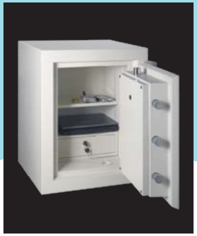
Fortress Safe Size 1