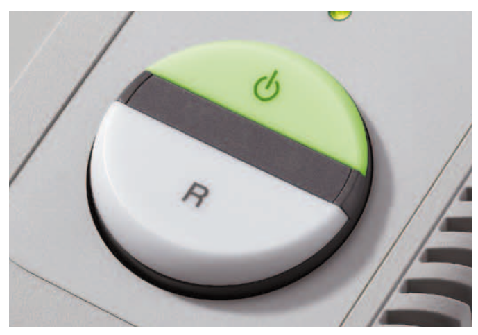
EASY_SWITCH Ease of operation: intelligent multifunction switch element with integrated optical signals indicating the operational status. Additional "emergency switch" function.