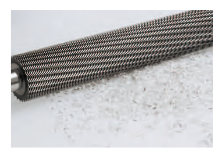
SOLID STEEL CUTTING SHAFTS Robust and durable: high-quality paper clip proof cutting shafts from special hardened steel. Lifetime guarantee on the cutting shafts under conditions of fair wear and tear (except fine cut models).