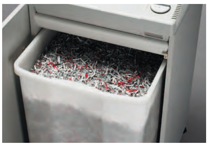
PRACTICAL SHRED BIN Convenient, environmentally-friendly shred bin (no disposable shred bags required).