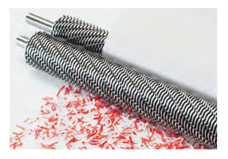
SOLID STEEL CUTTING SHAFTS Robust and durable: high-quality paper clip proof cutting shafts from special hardened steel. Lifetime guarantee on the cutting shafts under conditions of fair wear and tear.