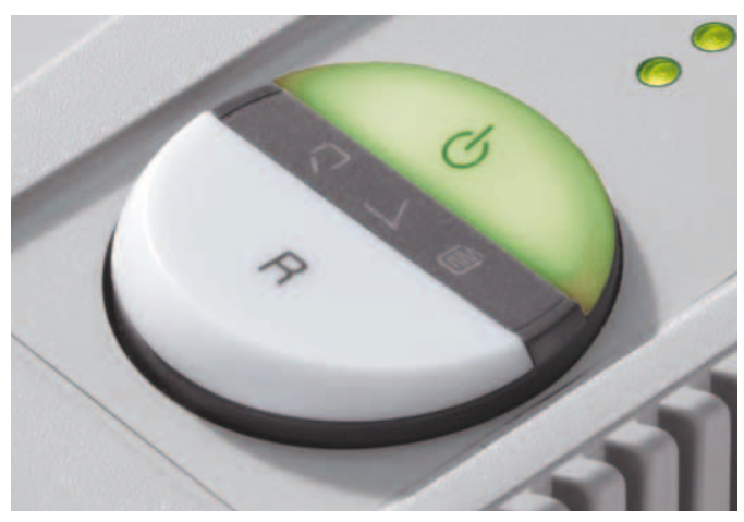
EASY_SWITCH Ease of operation: intelligent multifunction switch element with integrated optical signals indicating the operational status. Additional "emergency switch" function.