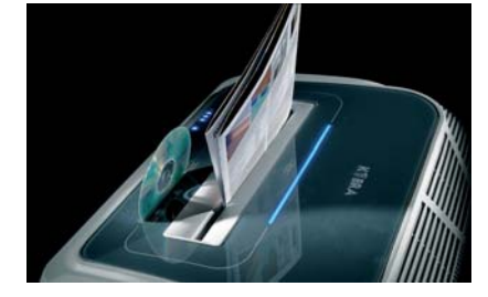
Two separate sets of cutting knives

Just touch the controls to activate the machine functions. Keep your finger on the "Forward" control for 5 seconds and the machine functions continuously for 30 seconds when transparent material needs to be shredded. A light comes on when the blades need to be oiled.