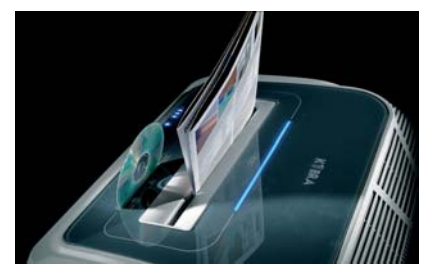
Two separate sets of cutting knives

Just touch the controls to activate the machine functions. Keep your finger on the "Forward" control for 5 seconds and the machine functions continuously for 30 seconds when transparent material needs to be shredded. A light comes on when the blades need to be oiled.