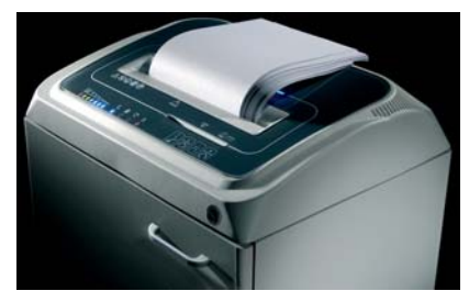
High shredding capacity

Two entry openings and two sets of cutting knives for the separate insertion and shredding of paper, CDs, DVDs, and credit cards and separation of shredded material into two bins.