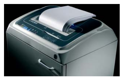
High shredding capacity

Two entry openings and two sets of cutting knives for the separate insertion and shredding of paper, CDs, DVDs, and credit cards and separation of shredded material into two bins.