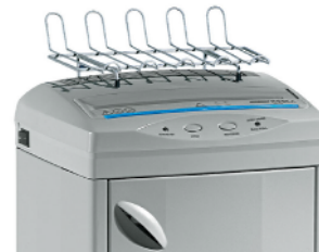
Computer forms top shelf to save office space (Space Saving Design)