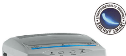
"ENERGY SMART" Management system for power saving stand-by mode