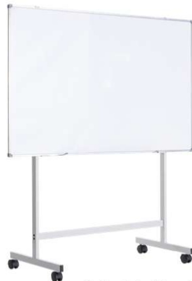
Optional stand for mobility Refer to page 93 & 94