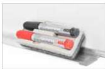
Foldable Pen Tray