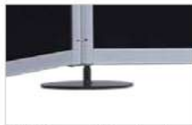
SL4 Smart Display Leg (Sold Separately)