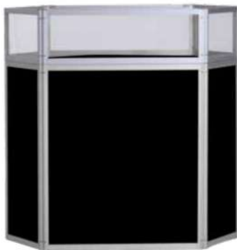
SDS01 Display Showcase