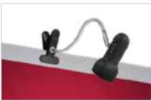
SSL3 Spotlight (Sold Separately)

For items you need to present and showcase, choose Smart Folding Display Panel. It entails up to ten (10) display options with a combination of variety in panel sizes for your creative creation.