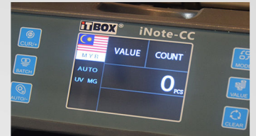
Large TFT 2.8 Color screen display