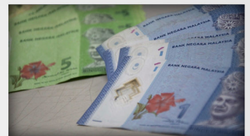
Compatible with RM1.00 & RM5.00 Plastic Note (Polymer 5)