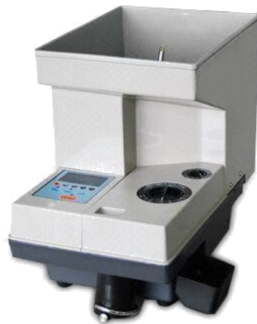
Coin Master CM4

The Coin Master series counter machine is a fast, compact single-denomination coin counter.