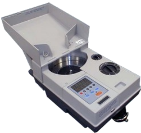
Coin Master CM2