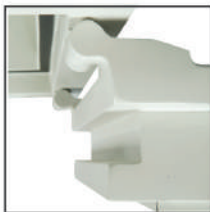
Vertical Interlocking Rebate System