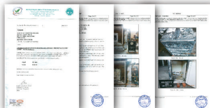
Tested & Certified to JIS S 1037 : 1989 FIRE RESISTIVE CONTAINERS