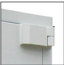
Heavy Duty Chassis