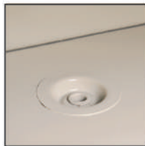
Mounting Hole (Optional)