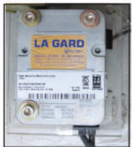
Glass Relocker (Optional)