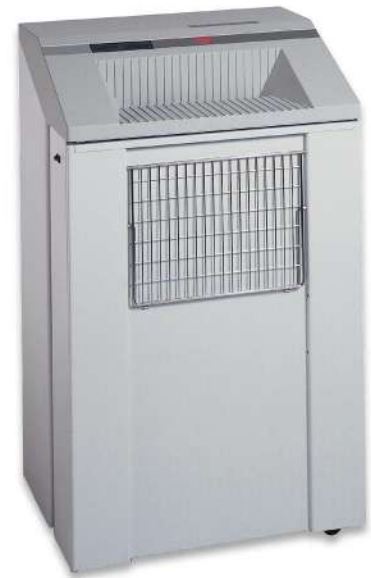
W/D/H 70 x 55 x 112 cm