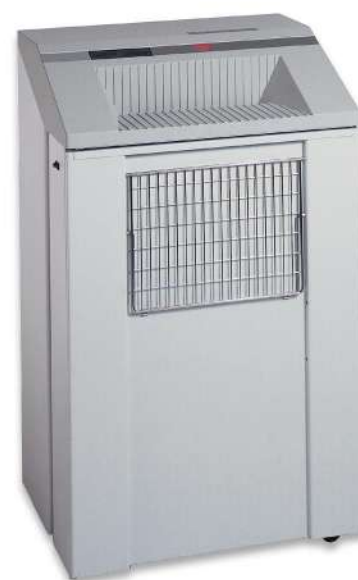
W/D/H 70 x 55 x 112 cm